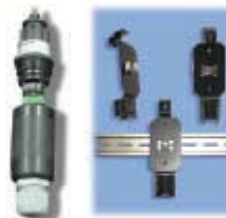
Remote Mtg. Kit

Use MSG 51-52-16-71 to order by catalog number. Select from Table II: “ 3 ” for a Meredian II pH Remote Connector “ B ” from Table III to get the Remote Mounting Kit and any options in Table IV.