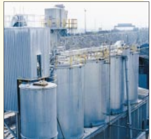
XPL Plus/Echomax transducers monitor levels in hot, dusty clinker tanks.

All Echomax transducers feature built in temperature compensation and higher output which improves self cleaning capabilities and reduces maintenance to a minimum.