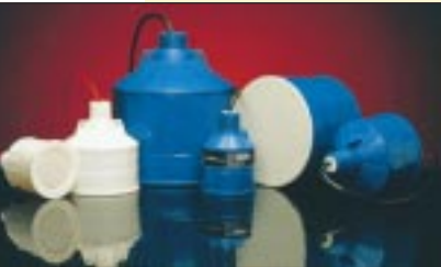
XCT and XPS series transducers.

With the sophistication of Sonic Intelligence ® echo processing harnessed to the power of Milltronics' ECHOMAX transducers, applications previously beyond the scope of any ultrasonics are now possible.