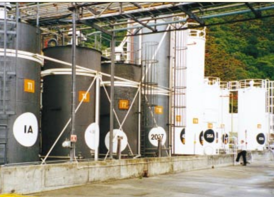
Inventory in 26 chemical tanks is measured and controlled remotely with three XPL Plus instruments linked to a centralized computer system in this paint manufacturing process.