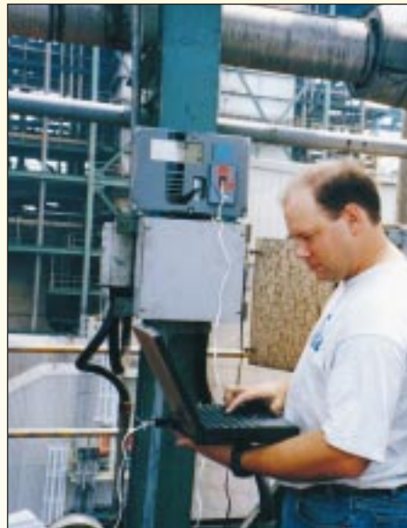
An AiRanger SPL is programmed with Dolphin Plus to monitor and control the level in flyash at a power plant in the far east.