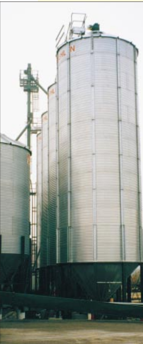
Multiple point level measurement in grain silos.

Sonic Intelligence: It's artificial intelligence with smarts.