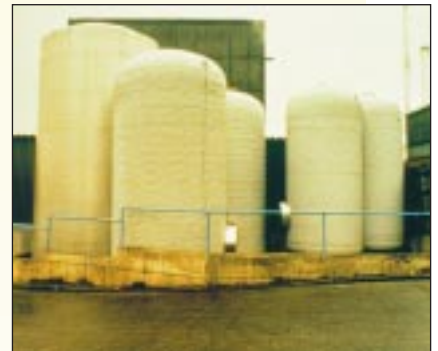
Non-contacting level measurement in latex vessels.